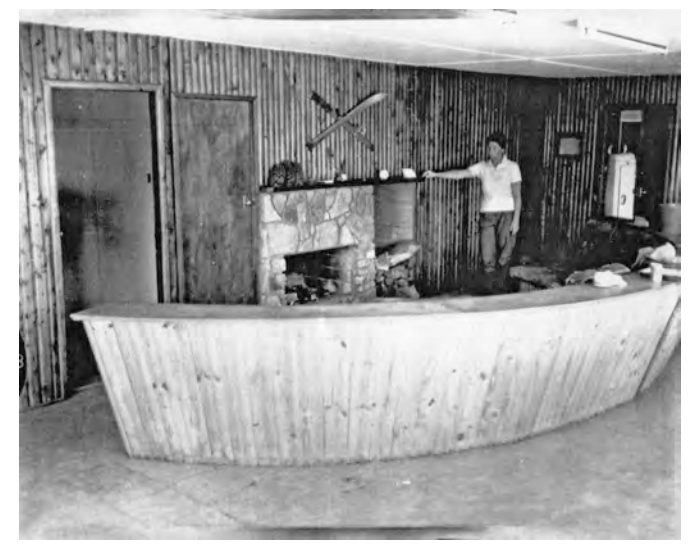
The circular lounge