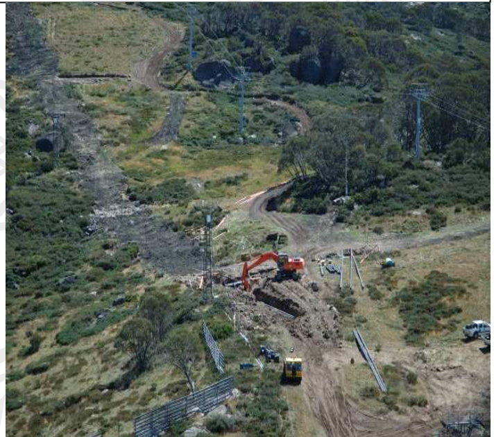
The Towers work site in early March 2009

Perisher now claims it has the highest snow gun operating in Australia at 2036m. $5.7 million dollars has been spent this year with new snowmaking covering Happy Valley and top to bottom on Towers Run as part of a three-year $19 million dollar snowmaking upgrade, including significant rock removal on Towers, 68 extra automated snow guns covering nearly 11 hectares & nearly 9km of piping.