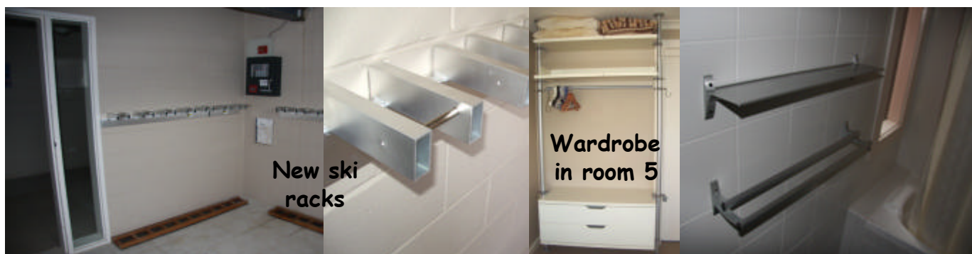
Some photos of the results of our working bee team's hard work