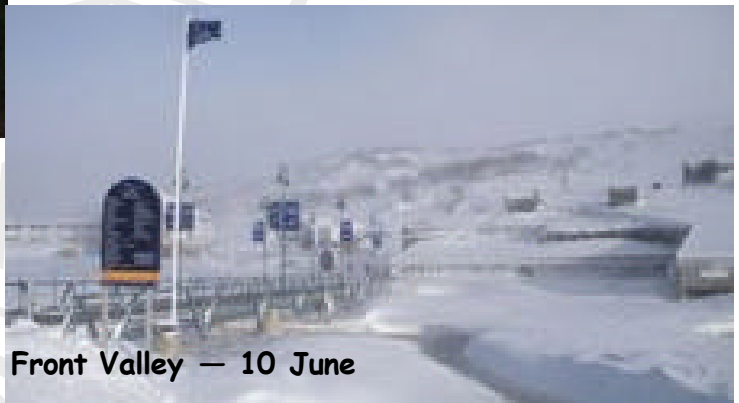
Front Valley — 10 June

Perisher was able to validate "It's OK to come early - we're making snow on Mt P" campaign by opening Towers on the next weekend, with Blue Cow and Smiggin Holes the weekend after.