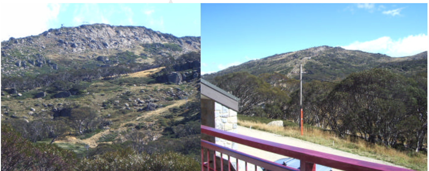
Perisher in Summer