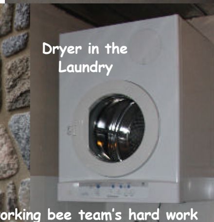
Dryer in the Laundry