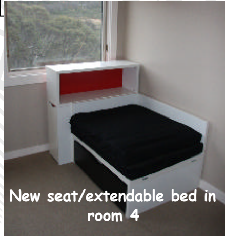
New seat/extendable bed in room 4