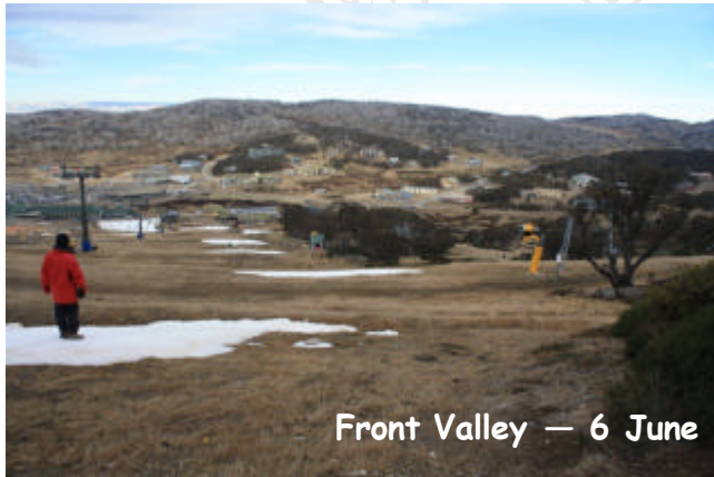
Front Valley — 6 June

Warrugang did its bit for the June long weekend Snowy Mountains of Music, accommodating some of the performers at the request of the Perisher Valley Chamber of Commerce. By all reports, the weekend was all the fun and enjoyment that had been hoped for - but, on the Saturday opening, the snow was confined to a small patch at the bottom of Front Valley.