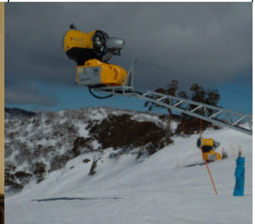
Snowguns above Goats Gully